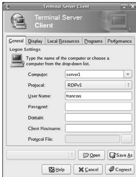
Figure 13-2: Terminal Server Client ( tsclient ) connects to Windows desktops.

Figure 13-2 shows the Terminal Server Client window.