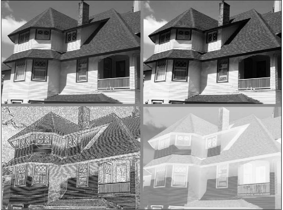
Figure 6-2: Start with a normal image and sepia tone, charcoal, and colorize it.

You may want to create thumbnails for your duck decoy collection images. Or perhaps you want to reduce all your wedding photos so they can play well on a digital photo frame. You might even want to add copyright information to every image in a directory before you share them on the Web. All these things can be done quite easily with the convert commands already described and some simple shell scripts.