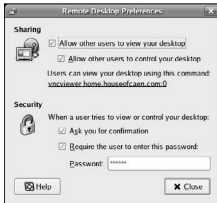
Figure 13-3: Vino lets remote users view, and possibly control, your desktop.

If you're running GNOME and would like to share your existing GNOME desktop ( display :0 ), you can do so with Vino (vino package). From the GNOME Desktop panel, select System ⇨ Preference ⇨ Remote Desktop to display the Remote Desktop Preferences window ( vino-preferences command) shown in Figure 13-3.