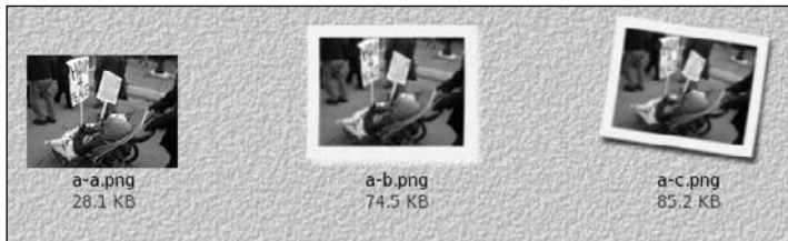
Figure 6-1: Use convert to create a thumbnail, Polaroid, and angled Polaroid.

All three examples create a 120 \times 120 thumbnail. The second adds the -polaroid option to put a border around the thumbnail, so it looks like a Polaroid picture. The last example sets the -polaroid angle to 8 so that the image looks slightly askew. Figure 6-1 shows the results of these three examples.