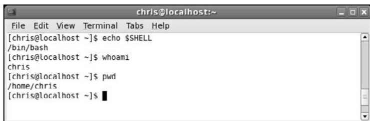
Figure 3-1: Type shell commands into a gnome-terminal window.

The gnome-terminal window not only lets you access a shell, it also has controls for managing your shells. For example, click File ⇨ Open Tab to open another shell on a different tab , click File ⇨ Open Terminal to open a new Terminal window , or select Terminal ⇨ Set Title to set a new title in the title bar .